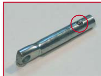
Spring loaded ball in pin